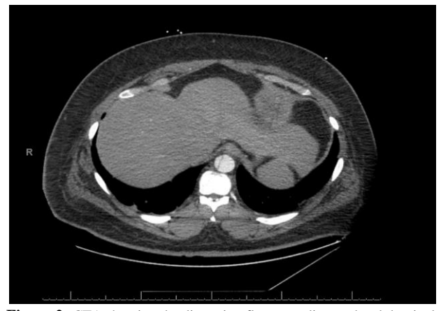
Figure 2: CTA showing the dissection flap extending to the abdominal aorta