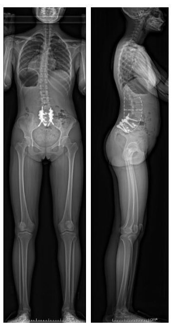
Figure 3: Plain radiographic images taken 2 years postoperatively. Scoliosis was spontaneously corrected. Sagittal malalignment improved showing L5I of 64° and a decrease of lordotic segments with inflexion point at T11. The sagittal plain radiographic image showed straight hip and knee joints postoperatively, which had been slightly flexed in an upright position preoperatively.

Figure 2: Preoperative MRI. No abnormalities were detected in MRI, except hyperlordosis of lumbar segments.