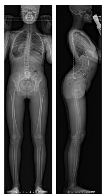
Figure 1: Preoperative plain radiographic images. The patient had scoliosis of 20° and sagittal malalignment showing longer lordotic segments with hyperlordosis of 104°. Note that the sacrum is angular shaped with extremely high PI (88°).

The patient had a height of 138 cm and body weight of 33 kg. Her trunk– limb proportion was reminiscent of limb shortening, and she kept a standing posture with her buttocks protruded posteriorly and bilateral knees and hips slightly flexed. Lumbar extension worsened low back pain without any radiation pain to the lower extremities. A straight leg raise test was bilaterally negative. She had no neurological deficits. Range of motion of bilateral hips and knees did not show any abnormal limitations.