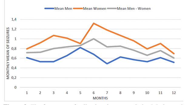
Figure 3: The frequency of epileptic seizures maximized during spring and summer.