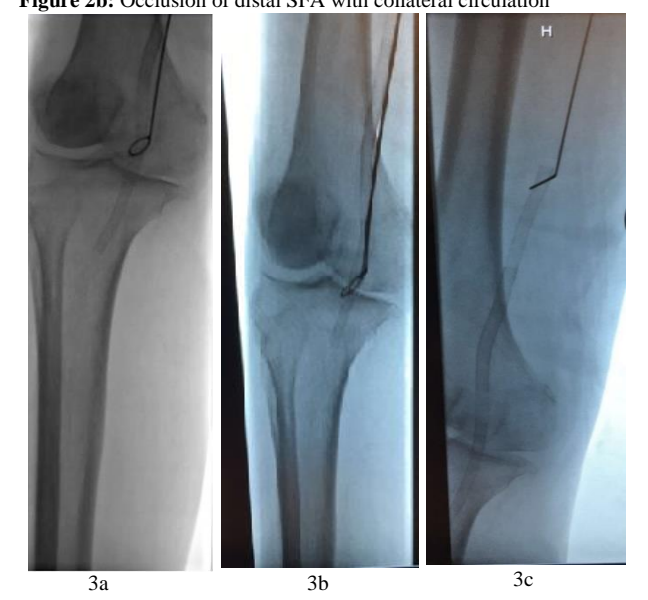
Figure 3a: Vollmar ring dissector being passed down to below the stent Figure 3b: Vollmar ring over terumo wire/ber II catheter as a lead Figure 3c: Mollring cutter being introduced down into the dissected plane