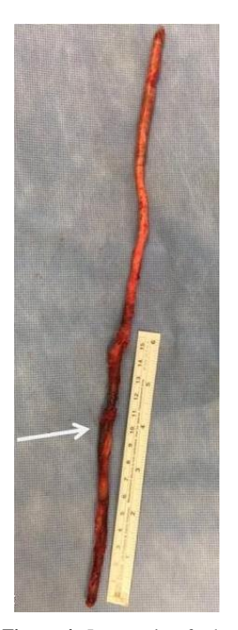
Figure 4: Long strip of atheromatous plaque removed en-bloc with stent, arrow indicating location of stent