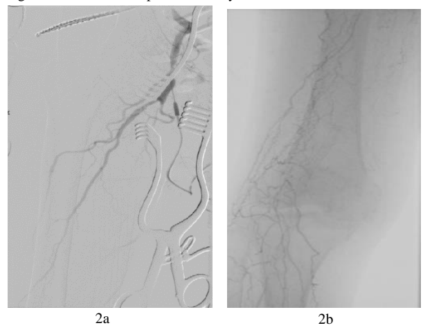
Figure 2a: Initial angiogram showing occlusion of SFA from origin Figure 2b: Occlusion of distal SFA with collateral circulation