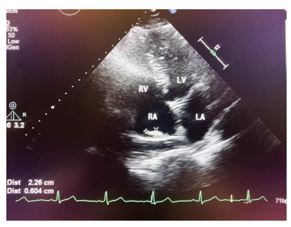
Figure 1: Transthoracic echocardiography apical 4 chamber view demonstrating right atrial mass adjacent to superior wall of the right atrium. RV: right ventricle, RA: right artium, LV: left ventricle, LA: left atrium.