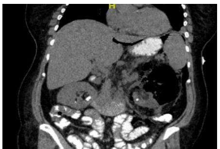
Figure 2: A coronal view of the CT abdomen/pelvis noting air extending from the left hemidiaphragm to the left pelvic brim encompassing the entire left retroperitoneum.