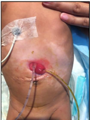
Figure 2: Picture shows proximal stoma on the right and distal stoma on the left of the figure. This technique was innovated for management of short gut. But the stomas have tubes inserted for collection. The Proximal stoma output is continuously collected in sterile bag and is inserted under aseptic conditions into the distal stoma intermittently.

Thorough peritoneal lavage was done with warm normal saline, volvulus was corrected, and gut health assessed, the atretic segment was resected and the proximal and distal ileum were brought out as stoma using the double barrel technique. In the postoperative period, parenteral nutrition and antibiotics were continued. Baby received N-acetyl cysteine through nasogastric tube for clearing the thick meconium. Feeds were gradually introduced from post-operative day 10. Baby started having loose stools following feed introduction. Sepsis workup and stool cultures were sent which were sterile. Feeds were changed initially to lactose free formula and later even to elementary formula. As loose stools persisted and fluid requirement was high, an innovative method was used wherein the proximal stoma output was collected in a sterile bag and put back into the distal stoma under aseptic conditions (Figure 2).