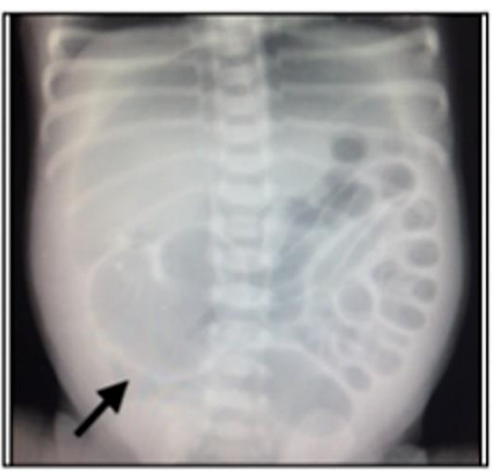
Figure 3: X-ray abdomen AP supine view showing dilated loops and a pneumoperitoneum suggested by football sign. Also, can be seen is a cystic calcified lesion in the right iliac fossa (arrow) suggestive of a meconium pseudocyst.

Baby B, term 2.8 kg female was born to a primigravida mother at an outside hospital with no antenatal risk factor. Born through elective cesarean and cried at birth with normal APGAR's. Baby was started on feeds. There was progressive abdominal distension with bilious aspirates and respiratory distress. Baby was made nil per mouth and referred at 20 hours of life. At admission baby was in cardiorespiratory failure, was resuscitated with ventilation, intravenous fluids, antibiotics and nasogastric drainage. Abdomen was grossly distended, tense and tender and tympanitic with positive transillumination. An urgent x-ray revealed a pneumoperitoneum and a cystic lesion in right iliac region with perilesional calcification suggestive of a meconium pseudocyst and antenatal perforation (Figure 3).