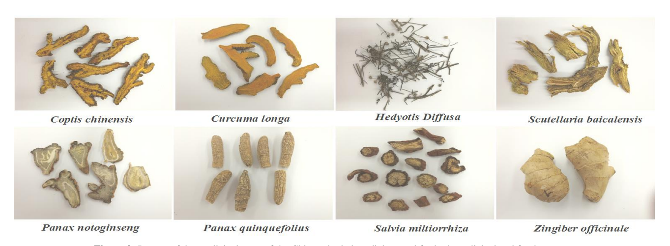
Figure 2: Images of the medicinal parts of the Chinese herbal medicine used for both medicinal and food purposes.

Clinically, H. diffusa has been used as a main component in some Chinese medicine formulas for CRC treatment. Ethanol extracts of H. diffusa have been shown to inhibit the proliferation of 5-FU resistant HCT-8 cells via downregulation of the expression of p-glycoprotein and ATP-binding cassette subfamily G member 2, and to inhibit proliferation and induce apoptosis in HT-29 cells through inactivation of IL-6inducible Stat3 pathway [16, 17]. Furthermore, the n-butanol fraction of P. notoginseng has been shown to inhibit proliferation and induce apoptosis in SW-480 cells, while potentiates the cytotoxic effects of 5-FU against HCT-116 cells [18, 19]. Interestingly, panaxadiol from P. notoginseng potentiated the cytotoxic effects of 5-FU against HCT-116 cells [20]. Moreover, ginsenoside Rg3 from P. quinquefolius or P. ginseng inhibited SW-480 cell migration via inhibition of NF- \kappa B, and