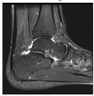
Figure 2: MR examination of the patient reveals the Haglund's deformity with no Achilles tendinosis.

The details of the surgical technique have been published previously [11]. We placed our patient prone with the arthroscopy monitors at the foot of the operating table. Under C-arm fluoroscopy guidance, we verified the placement of arthroscope and instruments and completed the excision of his Haglund's deformity (Figure 3). The retro-calcaneal bursa and the anterior aspect of the Achilles tendon were visualized and debrided endoscopically. A below-the-knee cast splint was applied with the ankle in 5 degrees of plantar flexion. Post-operatively, the patient was non-weight bearing for the first week with crutches to allow the soft tissues to heal. The splint was discontinued in one week and weight bearing and range of motion began as tolerated with physical therapy. A strengthening program began 2 weeks after the surgery and he returned to jogging at 12 weeks.