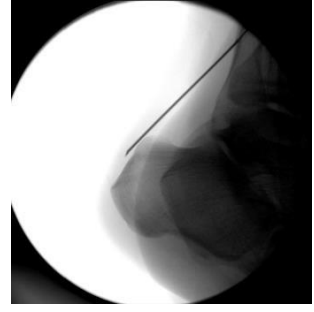
Figure 1: Fluoroscopic image done during surgery showing needle localization of the Haglund's deformity.

operative treatment. Alternative treatment options were discussed, however the patient elected to proceed with surgery.