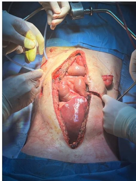
Figure 1: Perioperative images showing abdominal closure with creation of an ileostomy.

Pre-operative selective embolization of the inferior mesenteric artery (AMI) was performed [4, 10]. Following resection of the gastro-intestinal bloc (stomach, duodeno-pancreas, intestine, spleen), an aortic conduit (AC) was constructed from the donor's thoracic aorta and anastomosed to the recipient's infrarenal aorta. After hepatectomy, graft implantation began with caval replacement, followed by anastomosis of the aortic patch (containing donor CT and SMA) to the AC. An esophago(recipient)-gastric(donor) anastomosis was constructed. The patient was supported intraoperatively with continuous veno-venous hemofiltration and veno-venous bypass. Perioperatively, shortly after graft reperfusion, the patient experienced a brief episode of cardiac arrest due to hyperkalemia-induced ventricular fibrillation. Due to cardiac arrest, a second look at 24h post-transplant was planned, where we completed the esophago-gastric anastomosis by a Toupet fundoplication and a pylorotomy. Abdominal closure was done by non-vascularized rectus fascia transplant and standard skin closure with ileostoma construction (Figure 1) [11].