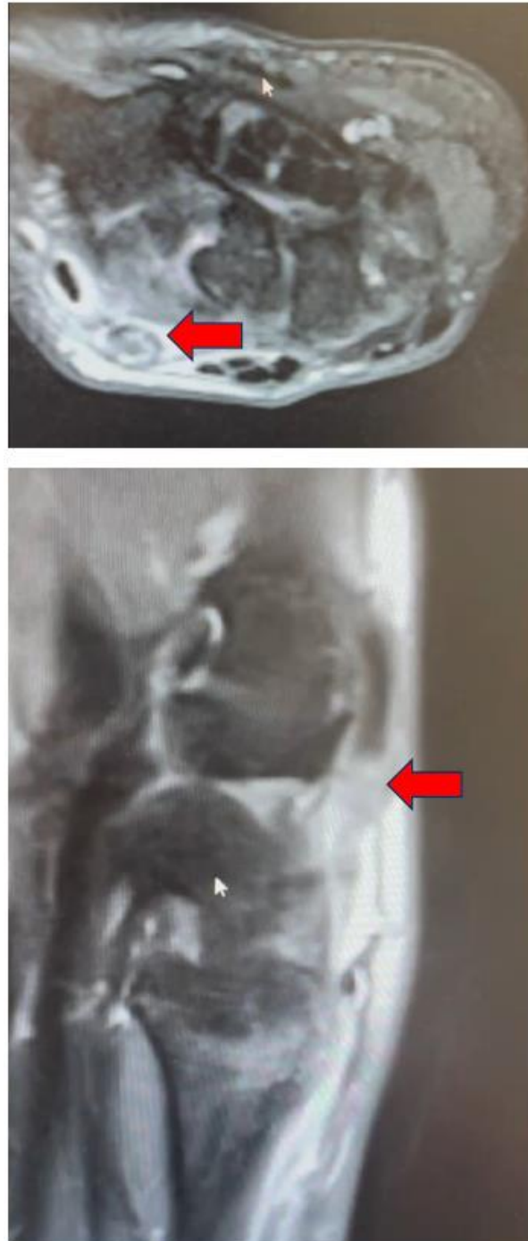
Figure 1: MRI studies showing lesion of the ECRB tendon (arrow).

the dorsal aspect of the 2 nd /3 rd metacarpals and was associated with impaired wrist motion, mainly extension, which compromised her daily routine activities. At first, she tried to manage the case with rest and NSAID medication, with non-satisfactory results. Upon physical examination, there was noted radial dorsal side pain associated with wrist extension strength deficit when comparing with the contralateral side. MRI exam demonstrated an isolated distal ECRB rupture with associated fibrous tissue being present proximal to the extensor retinaculum (Figure 1). Surgical management of this lesion was decided.