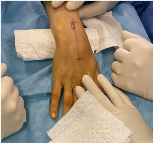
Figure 2: Surgical approach.

Under a brachial plexus block, a straight skin incision was made over the dorsum of his left wrist, lining with the Lister's tubercle (Figure 2). Careful dissection was performed, incising and opening the extensor retinaculum. ECRB distal midsubstance rupture was then evident with the distal limb of the tendon being attached to the proximal limb by a slim fibrous tissue connection (Figure 3). Degenerative fibrous tissue was carefully debrided of the ECRB. The remaining healthy proximal and distal limbs of ECRB were subjected to tenodesis with ECRL, by a side-by-side technique, using P.D.S. suture (Figure 4). Judicious closure and dressing were applied, and a wrist extension cast was used.