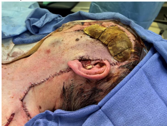
Figure 4: Patient after facial reconstruction operation following wide excision of facial mass. Full thickness skin graft measuring 10.5 × 5.5 cm transplanted into the left temporal area following rhytidectomy with the dissected cervical facial skin flap.