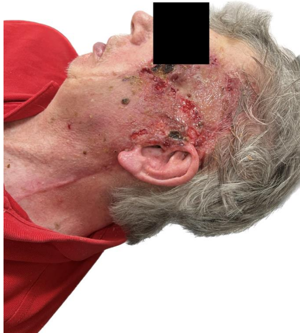
Figure 5: 11 weeks post-operative follow-up showing healing cervicofacial flap with full thickness skin-graft with external beam radiation therapy.

At the patient's one month follow up appointment, the patient's full thickness skin grafts and surgical site was noted to be healing well without any major complications as depicted in (Figure 5) below. No further surgical intervention was needed. All clinical and pathological details and reports indicate a final diagnosis of facial leiomyosarcoma; mitotic count 8/mm 2 , grade 3; pathological stage IIIB (pT4aN0M0). The patient was subsequently scheduled for clearance in order to undergo a course of external beam radiation to the left malar and zygoma area. At this visit, the patient elected not to undergo adjuvant chemotherapy given his age and current comorbidities.