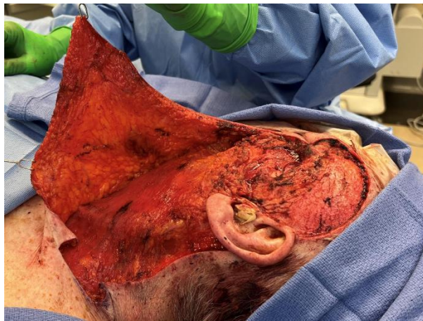
Figure 3: Cervical facial skin flap dissection from the left cheek down inferiorly to the clavicular portion of the neck measuring 17 × 13 cm with intention to reduce initial defect size through rhytidectomy of the dissected skin.