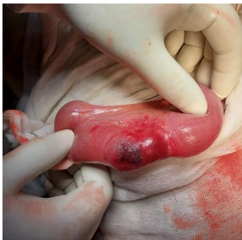
Figure 3: Intraoperative picture showing a part of the circumference of bowel wall having ischaemia.