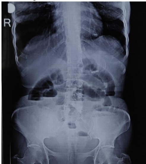
Figure 1: Pre-operative radiograph showing features suggestive of small bowel obstruction.

resected and end to end anastomosis with hemiorrraphy was done. Post operative period was uneventful and patient recovered with no complications. Patient was discharged in pod 6 and is on regular follow up.