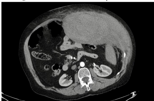
Figure 2: Axial image of abdominal tomography.

In 48 hours, the patient presented significant bleeding with changes in the static (Figure 3) and dynamic physical examinations, which showed haemodynamic instability due to significant volume loss while waiting