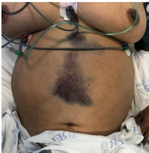
Figure 1: Abdominal examination at hospital admission.

varices and esophageal candidiasis KODSI II. Patient refers endoscopic ligation eight years ago. Computed tomography (CT) of abdomen confirmed an extensive hematoma of the rectus abdominis muscle crossing the arcuate line and midline. Despite not having haemoperitoneum or blood in the pre-vesical space of Retzius, it was classified as RSH type III (Figure 2).