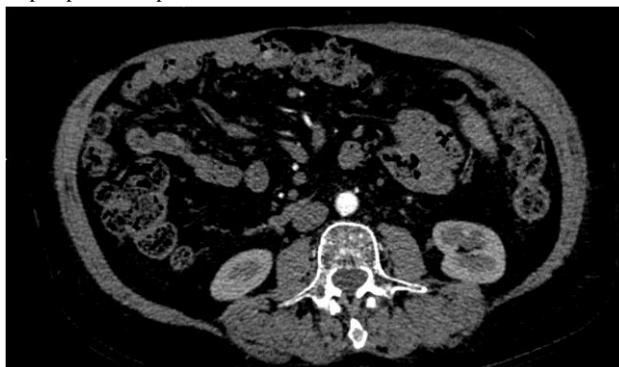
Figure 4: Absence of hematoma.

patient remained at hospital for 16 days when he was discharged with significant resorption of the hematoma and no signs of infection. The patient had no hematoma after 10 months (Figures 4 & 5).