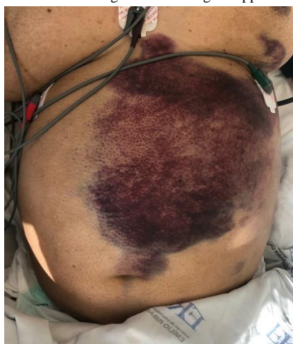
Figure 3: Expanding hematoma after 48 h.

for the procedure to be performed, evolving with hypovolemic shock, requiring vasoactive drug (noradrenaline 0,22mcg/Kg/min). Indicated surgical approach through armed arteriography.