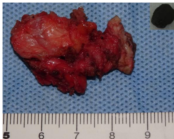
Figure 3: The urachal remnants with calculi were clumped together due to inflammation.