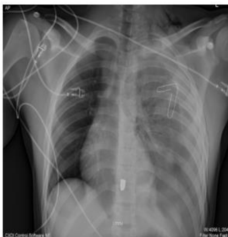
Figure 1: Chest radiograph prior to chest tube placement, notable for presumed entrance site at tip of paper clip, retained missile at T10, and left-sided hemothorax.

A previously healthy 19-year-old male was brought to the ED after he sustained gunshot wounds to the face, hand, and left thorax. On presentation to the trauma bay his airway, breathing, and circulation were intact, and the patient’s vitals were within normal limits and stable on room air. A chest radiograph demonstrated a left-sided hemothorax and a ballistic missile abutting the patient’s spine near T10-11 (Figure 1). Cardiac ultrasound revealed a large pericardial effusion (Figure 2). A chest tube was placed with return of frank blood, and the patient was taken to the operating room.