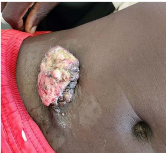
Figure 2: Ulcerative budding skin tumor of the right abdominal wall.