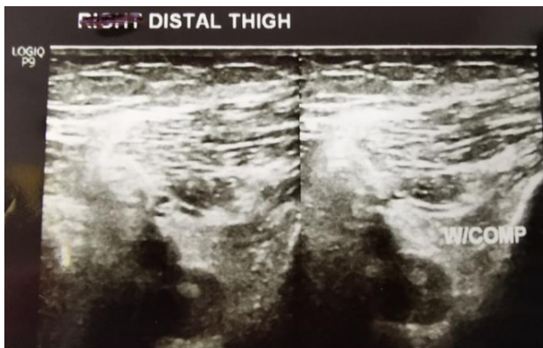
Figure 1: Left distal thigh before.

Patients were started on 12 cycles of adjuvant Platinum-based FOLFOX regimen (Oxaliplatin, Leucovorin, and continuous Fluorouracil infusion). Patient chemotherapy administration was uneventful until the 4 th cycle. Upon completing the 4 th cycle, the patient complained of numbness at the left lower limb. His left lower limb was swollen, and his skin appeared pale. The initial impression was DVT and Doppler ultrasound on the left distal thigh and left middle thigh was done to confirm the diagnosis. The femoral vein from the upper thigh to the knee was non-compressible. The reduced blood flow from the distal to the middle thigh of the femoral vein was a suggestive feature of thrombosis. The left popliteal vein was also non-compressible, but no echogenic material was seen within. The result of the Doppler ultrasound concluded that the patient was diagnosed with left lower limb DVT. (Figures 1 & 2).