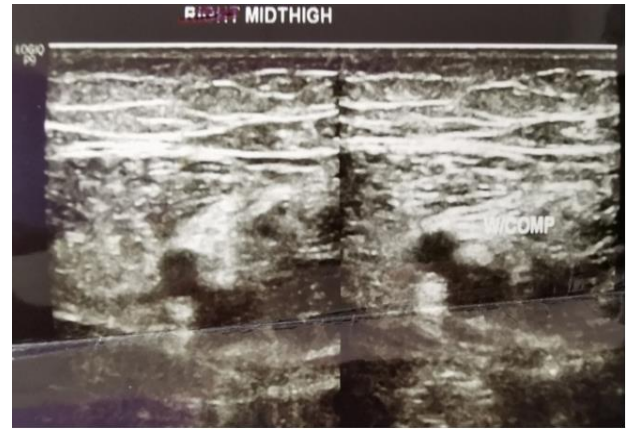
Figure 2: Left middle thigh.

The patient was started with subcutaneous Enoxaparin 60mg two times daily according to American College of Chest Physicians (ACCP) guidelines [3, 7, 8]. However, the patient rejected treatment given the prolonged treatment duration required and hesitance of compliance to subcutaneous injection. Warfarin was ruled out due to few factors such drug-drug interaction with Fluorouracil, restriction of monitoring for chemotherapy patient and high bleeding risk in cancer patient [2, 3, 8, 14]. Pharmacists suggested NOACs such as Rivaroxaban (Xarelto) as a suitable replacement for this patient, and patients' enoxaparin treatment was bridged to Rivaroxaban to improve compliance.