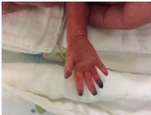
Figure 3: Day 7 of treatment.

No prior attempts to place a radial arterial line nor to draw blood from that site were noted. A complete thrombophilia screen (antithrombin III, lupus anticoagulant, protein C, protein S and factors II, X, VII and MTHFR and factor V Leiden) was negative except for heterozygous state for factor V Leiden. On day 6 of life, Enoxaparin was started because worsening limb ischaemia progressed (Figure 2). Enoxaparin was discontinued 13 days later after the baby developed intraventricular hemorrhage (IVH) grade 1. As an alternative, a ribbon of 2% nitroglycerine ointment (4 mm/kg) was applied to the fingers, approximately 2 cm proximal to the line of pallor, every 8 hours. Improvement in color and perfusion was noted after the first dose. Methaemoglobin levels remained below 1%. By day 12 of treatment, the ischaemic area was limited to the fingertips only (Figure 3). Topical nitroglycerine was discontinued after 30 days when the fingers had recovered full perfusion and the nail beds were intact except for the ring finger, where half of the nail bed was lost (Figure 4). The baby was eventually discharged home at 37 weeks and 3 days postmenstrual age. She is currently healthy and has a minor loss of the right ring fingertip.