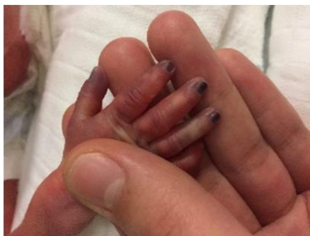
Figure 1: Initial presentation.