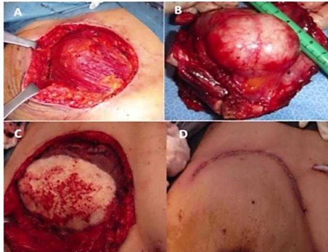
Figure 1: A) Circular incision around the breast. B) Tumor excised specimen en-bloc with the adjacent part of the ribs. C) Chest wall defect reconstructed with modified (MMS) Cement & Marlex mesh sandwich technique. D) Skin closure preserving the breast contours.