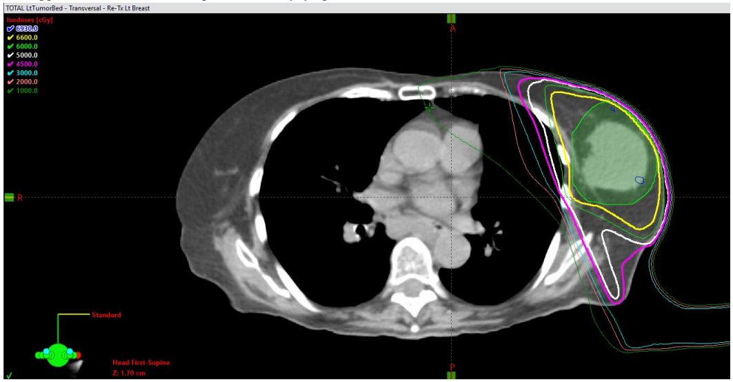
Figure 1: CT of patient 1 with dose painting treatment plan of the left breast.

node. The lesions were excised with a close margin, and the lymph node was removed both with limited anaesthesia as the patient had developed cardiac comorbidities, including ventricular arrhythmia which precluded more rigorous surgery/anaesthesia. The tumor was ER/PR positive, HER 2 Neu negative and the decision was made to move forward with comprehensive radiation therapy including full regional therapy, as the primary lesion was medial with a positive axillary node. There was no attempt to generate conformal avoidance of the previous site of DCIS due to the positive node. The patient received 4500 cGy in 180 cGy fractions to peripheral breast tissue and regional areas of concern. The surgical cavity received 5000 cGy in 200 cGy fractions with dose painting with an additional 1440 cGy to the surgical cavity as a boost to bring the total dose of the surgical cavity to 6440 cGy. Her current therapy was delivered with image guidance and intensity modulation.