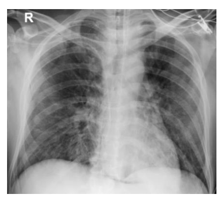
Figure 2: Chest X-ray showing bilateral reticular interstitial opacities that have increased in the right pulmonary field and peripheral ground glass opacity occupying the middle region of the left pulmonary field.

On the 11th day of hospitalization (08.05.2020), given the persistence of pancytopenia and hyperferritinemia, a bone marrow aspiration was performed with flow cytometry where no myeloid blasts were detected in 9,147,296 events, however the myelogram shows findings compatible with hemophagocytosis (Figure 3).