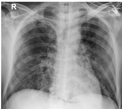
Figure 2: Chest X-ray showing bilateral reticular interstitial opacities that have increased in the right pulmonary field and peripheral ground glass opacity occupying the middle region of the left pulmonary field.

On the 11th day of hospitalization (08.05.2020), given the persistence of pancytopenia and hyperferritinemia, a bone marrow aspiration was performed with flow cytometry where no myeloid blasts were detected in 9,147,296 events, however the myelogram shows findings compatible with hemophagocytosis (Figure 3).