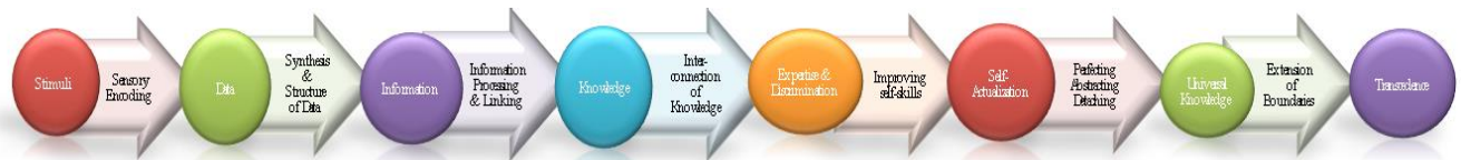
Figure 2: Cognitive and metacognitive processes required in order to move from a layer to another [8].

‘building’ the pyramid of knowledge (Figure 1) and utilize the information to reach the top layer [8]. As we can perceive, for each layer of the pyramid of knowledge, we have to define the skills that will help children and individuals to organize their knowledge in order to jump directly to the next layer (Figure 2) [8].