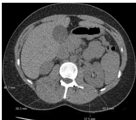
Figure 1: Axial view of the abdominal CT-scan shows a right-sided paraspinal muscle swelling compared to the healthy left side and no active bleeding. We excluded kidneys, bony and other pathologies.

The CT-scan of the abdomen showed right-sided perifocal edema of the paraspinal muscles (erector spinae and quadratus lumborum) in the thoracolumbar region. There was no active bleeding. Both kidneys had a normal appearance (Figure 1). We conducted a compartment pressure measurement using Compass Universal Hg (Centurion ®) with an 18-gauge needle, saline-filled syringe, and injection of 0.3cc of saline at the level of L2. This yielded a pressure measurement of 135mmHg. The contralateral side was not measured due to missing clinical symptoms. An emergency MRI was performed due to non-specific neurological symptoms as described above to exclude intraspinal pathology. The MRI confirmed intramuscular edema of the right paraspinal musculature, without intraspinal pathology or compression of neurologic structures (Figure 2).