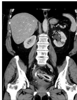
Figure 4: Axial CT scan performed 7 days after stent positioning, showing sign of stent displacement into the bowel lumen and infiltration of perisigmoid adipose tissue.

adenocarcinoma with adipose tissue and serosa perforation due to the ischemic necrosis of the sigma wall where the stent was placed.