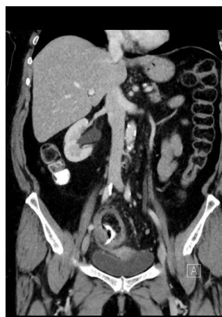
Figure 5: Coronal image from a contrast enhanced CT scan performed 7 days after stent positioning showing stent displacement and high suspicion of bowel perforation.

Furthermore, peritoneal fluid washing showed malignant cells. The patient went finally home in good conditions. A PET-TC performed one month later showed the presence of increased glucometabolic activity and presence of micronodules in the pelvic excavation, in the Douglas hollow and in the mesorect were highly suspicious for peritoneal carcinosis. Because of the pT4a stage and the positivity peritoneal lavage recognized as a negative prognostic factor conditioning recurrence (peritoneal and extraperitoneal) and survival, chemotherapy with fluoropyrimidine with oxaliplatin has been proposed to the patient