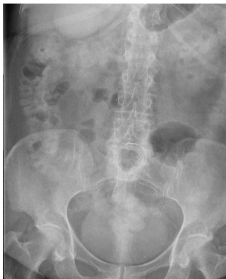
Figure 3: Abdominal CR image showing the correct positioning of the self expanding metallic stent.

Seven days later the patient came back to the emergency room because of some cramp-like abdominal pain localized in the lower quadrants. The CT-scan showed a small air bubble located on the anterior wall of the stent (Figures 4 & 5). The patient underwent a laparotomy with sigmoid and rectum resection. The histology showed a moderately differentiated