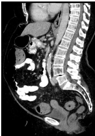
Figure 1: Sagittal image from a contrast enhanced CT scan showing a circumferential thickening of the sigma walls with a minimal infiltration of perisigmoid adipose tissue.

differentiated adenocarcinoma of the colon. The patient restarted a normal feeding with regular bowel function and went home with the resolution of symptoms.