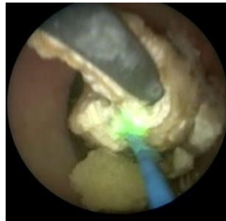
Figure 3: Endoscopic view of the forgotten double J stent with thick layers of encrustation around the stent during removal by holmium YAG laser.

This session pertained to the management of proximal ureteric stones (Figure 3). In brief, with the help of a semi-rigid ureterscope, a 0.64-mm straight tip Terumo guidewire was smoothly placed inside the kidney, and a 0.89-mm straight tip Roadrunner guidewire was inserted. The flexible ureterscope (Richard Wolf Medical Instruments Corp., USA) has outer and tip diameters of 9.9 F and 6 F, respectively. This instrument has identical upwards and downwards deflection of 270°. The Ho: YAG laser was inserted (200-272 \mu m fiber, Mega pulse stone laser, Richard Wolf Medical Instruments Corp.) for fragmentation. The laser apparatus settings were adjusted to provide 200-4000 mJ with a pulse frequency of 3-25 Hz. After complete fragmentation, the process was stopped when only very small stone fragments (2 mm) were visible, preventing the need for basket stone retrieval. The laser fiber was then withdrawn. When the stone was fragmented into significant fragments (>3 mm), the fragments were removed with zero-tip N Gage basket (Cook Urological Inc., USA). The middle and proximal ureteral stones were cleared, and encrustation over the middle and upper part of the stent was eliminated within the second consultation.