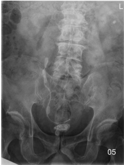
Figure 1: X-ray kidney-ureter-bladder revealed a forgotten double J stent for 10 years with bladder calculus formed in the lower coil and multiple stones in the ureter with upper coil in the proximal ureter.

was visible in the urinary bladder. The total stone burden in the ureter was 81 mm, and the stone bladder was 42 mm (Overall stone burden 123 mm). These findings were confirmed using CT KUB scan.