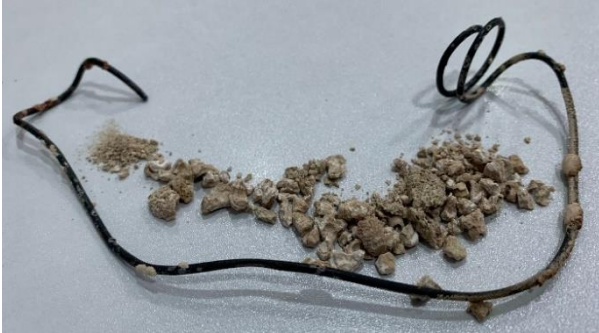
Figure 4: Picture shows the removed forgotten double J stent with peeled outer layer and multiple stone gravels.

composition to include calcium oxalates monohydrates, calcium oxalates dihydrates, and calcium phosphates. Stent swab culture revealed infection by Burkholderia spp.