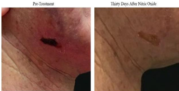
Figure 3: 66-year-old female, smoking-induced ulcer post-Rhytidectomy. Re-epithelialization at 7 days, ongoing healing and scar reduction at 30 days.