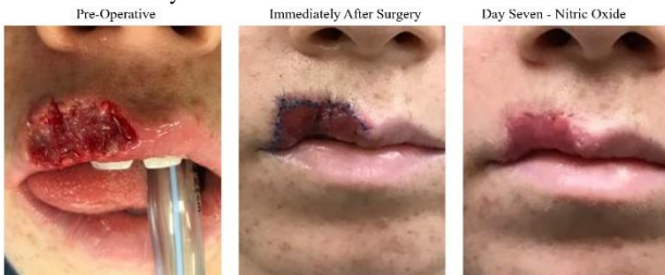
Figure 4: 28-year-old female status post dog bite reconstruction with local flaps. Marked improvement in vascularity, reduced edema, and bruising with NO application.