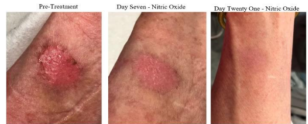
Figure 6: 52-year-old female, status non-healing 2 nd -degree burn for 2 months. Re-epithelialization after 7 days of NO serum. Marked healing after 21 days of NO serum.

The anti-inflammatory and accelerated keratinization effects of the nitric oxide generating serum were demonstrated in the acne and acne-scarred patient population [16]. This study also demonstrated the safety of applying the NO serum on open wounds, yielding added anti-bacterial