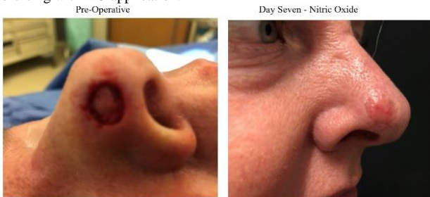
Figure 5: 36-year-old female, status post basal cell excision, full-thickness skin graft reconstruction. At 7 days post-op, neovascularization in healthy flap visualized.