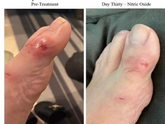
Figure 7: 46-year-old diabetic male, non-healing foot ulcer. Re-epithelialization 30 days post NO serum.