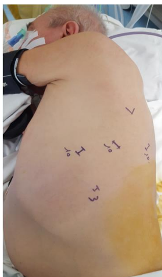
Figure 1: VATS approach for adrenalectomy and lobectomy.