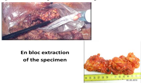
Figure 4: En bloc extraction of the adrenal gland.

A VATS lobectomy is then performed with hilar and mediastinal lymphadenectomy. The pain control was obtained with a paravertebral catheter inserted in the seventh intercostal-vertebral space. The catheter was removed at the same time of the chest tube removal. The patient was discharged at home with paracetamol and a nonsteroidal anti-inflammatory drug regimen, which is continued during physiotherapy. The postoperative course was uneventful, and the patient was discharged on the third postoperative day. After a 24 months follow up, the patient is still alive without cancer recurrence.