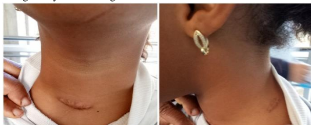
Figure 5: Final postoperative appearance after 1 month.