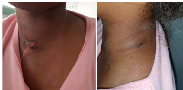
Figure 4: Final postoperative aspect on day 2 after extraction of the foreign body and suturing of the wounds.