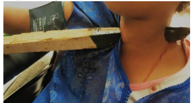
Figure 1: When the child arrives, there is a wooden stick piercing the neck on both sides. The bar entered anteriorly and exited from the laterally.

hemodynamics and respiratory function. Her pulse was at 95 bpm, her blood pressure at 115/70 mmHg, and her SpO 2 at 98 % to ambient air. Examination of the cervical region found a wooden stick piercing the neck, with an anterior entry point and moving diagonally to a left lateral exit point, thus occupying zones I and II of the neck (Figure 1). The presence of a carotid pulse and the absence of a cervical hematoma are noted. There also was no sign of stridor, nor dysphonia, nor subcutaneous emphysema. Vesicular murmurs were normally perceived and symmetrical to pulmonary auscultation.