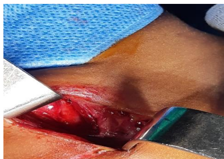
Figure 3: The stick was successfully removed: the integrity of the jugulocarotid pedicle was noted after the extraction of the foreign body.

After irrigation and washing with physiological serum, the entry (anterior) and exit (lateral) wounds were sutured (Figure 4) and the patient left with intravenous Antibiotics for 05 days. Postoperatively, we monitored: hemodynamic constants (heart rate, blood pressure), respiratory functions (respiratory rate, oxygen saturation, pulmonary auscultation), neurological constants (GCS, focal neurological deficit), temperature as well as local appearance (monitoring for the installation of a hematoma, subcutaneous emphysema, wound infection). There were no complications. The child was discharged after 5 days of hospitalization. At 1-month follow-up (Figure 5), she is doing well with well-healed wounds. No anomalies have been identified. A Doppler ultrasound was performed and did not reveal a jugulocarotid pseudoaneurysm.