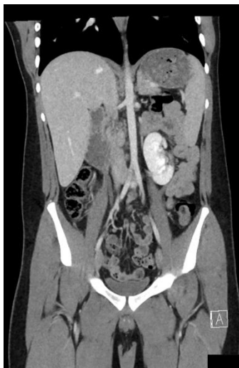
Figure 3: Coronal CT reformat of the abdomen and pelvis demonstrates no para-aortic lymphadenopathy and no distant metastatic disease. Incidental note is made of a malrotated left kidney.