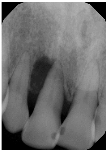
Figure 3: Periapical radiograph, after trauma.

Based on the clinical and radiographic findings, drainage was achieved by preparing an endodontic access on the cingulum area and piercing the pulp with an endodontic file (K-File, Premier). Gentle compression of the labial mucosal tissue enhanced the drainage of infection and continued until there was no purulent exudate visible and normal bleeding was initiated. The canal was irrigated with 5% sodium hypochlorite solution and was left open for continued drainage, until the next appointment [6]. A prescription for antibiotic was given (Amoxicillin 500 mg, every 8 hours and Metronidazole 500 mg, every 6 hours, for one week) [7]. Over-the-counter analgesic (Ibuprofen 200 mg) was recommended for pain control. Patient was seen for a follow up two days later. The swelling was considerably subsided and there was no complaint of pain. The canal was inspected and closed with a cotton