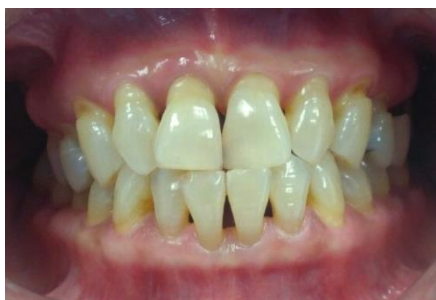
Figure 2: Intraoral photograph.