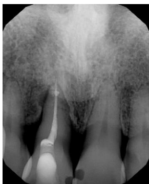
Figure 9: Periapical radiograph, 6 months postoperative.