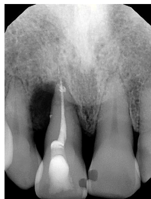
Figure 4: Periapical radiograph, after root canal therapy.

After one week from the initial appointment, the canal was cleaned and shaped and the endodontic treatment was completed, following the standard protocol (Figure 4) [8]. The access cavity was subsequently restored with composite resin material (Tetric Evoceram, Ivoclar Vivodent). Periapical radiographs taken after 2 weeks, one month, 2 months, 3 months and 6 months show gradual resolution of the lesion (Figures 5-9). Concomitant with healing of the lesion, the mobility of the tooth had been improved significantly and was comparable to the adjacent teeth. To further protect her dentition from occlusal trauma, a night guard was fabricated, and the patient was put on a 4-month recall for oral hygiene and examination (Figure 10).