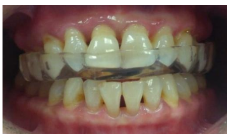
Figure 10: Intraoral photograph, night guard in place.