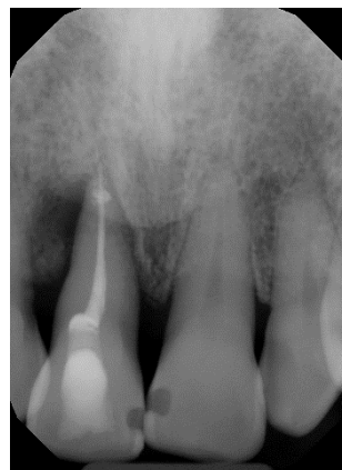
Figure 6: Periapical radiograph, 1 month postoperative.