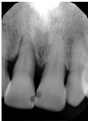
Figure 1: Periapical radiograph, 6 months prior to trauma.