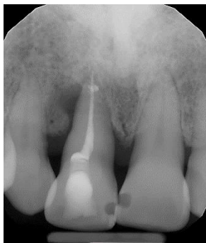
Figure 7: Periapical radiograph, 2 months postoperative.