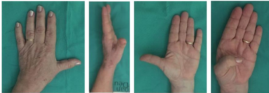
Figure 2: Clinical picture showing the ROM obtained. The optimum ROM was achieved after 2 months and was maintained till the end of the follow-up.