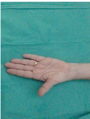
Figure 3: Video showing the final ROM.