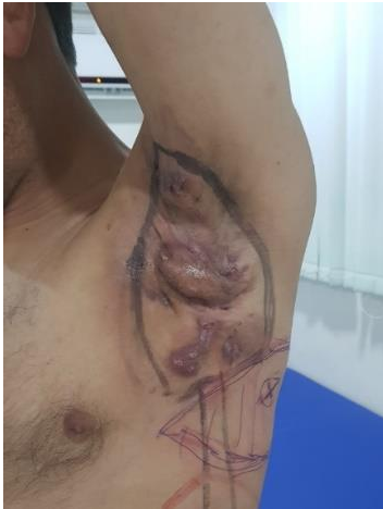
Figure 1: Pre operative markings.