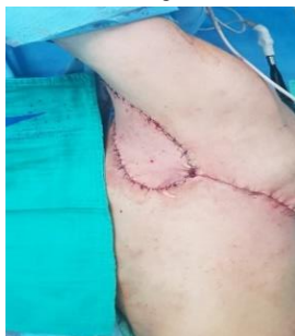
Figure 6: Immediate post-operative aspect and primary closure.

The perforator may not be skeletonized by keeping a 2cm muscle collar around it, in order to reduce the operating time and increase the venous drainage [7]. While in the second case, we encountered a very thin septocutaneous perforator (Figure 5), we noticed at the end of dissection that the perforator spasmed and the vascularization of the flap was precarious and we inset the latter as a propeller fashion. The nerve was spared, and the donor side was primarily closed in two layers with drain in both cases (Figures 6 & 7).