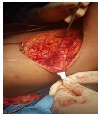
Figure 4: Musculo cutaneous perforator.

Hwang et al. described that longer flaps can be raised by using the various modifications to ensure perfusion either by including more than one perforator from the same branch of thoracodorsal vessel or perforators from different branches of thoracodorsal artery and also by including the intercostal artery perforator at the distal end of the flap (12) article thoracodorsal artery flap indeed a versatile flap [6]. The patient is placed in lateral decubitus, arm in abduction and elbow at 90 degree. The flap is raised from posterior to anterior above the muscle, care has to be taken not to injure the perforators with a very gentle dissection. In the first patient, a musculocutaneous perforator was found, and dissection was carried out until the emergence of the pedicle (Figure 4).