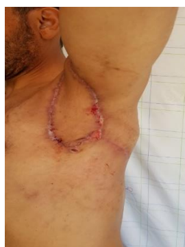
Figure 8: 1-month post-operative aspect.

Similar study in 2014 worlmand et al. highlighted the superiority of perforator flaps over thin skin graft in terms of postoperative course and quality of life on 27 patients [9]. Directed healing is still a therapeutic alternative, but the major shortcomings are healing time, pain and postoperative skin contractures. They have been followed up to one year and both of patients were very satisfied and resumed very soon their activities and none of them complained about the functional outcome.