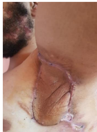
Figure 9: 1-month post-operative aspect.

A study conducted between November 2013 and June 2015 including 17 patients treated by local perforator flaps showed that the axillary reconstruction with TDAP flaps has a complete healing period of twenty days and improved quality of life with preserved mobility and very good functional outcome. The same study shows that the recurrence rate was 0% over a period of 279 days [10]. Another study conducted by Aharbi et al. compared the TDAP flap with other surgical techniques in term of recurrence, and the rate was very high in the case of direct suture or skin graft (41 evaluation of the mobility of the shoulder and the quality of life) They have not complained about the scar that has fade overtime (Figures 8 & 9) [11].