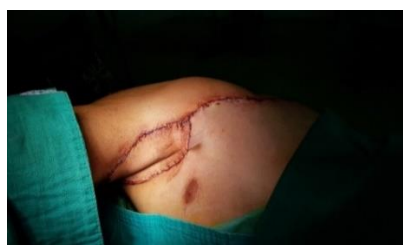
Figure 7: Immediate post-operative aspect.

Skin grafts can be associated with a dermal matrix, but these have the disadvantage of realizing a patch effect without bringing significant volume. A study conducted in 2018 compared between the perforator flaps and dermal matrix in terms of quality of life, healing time, length of care giving, resumption of professional activity and long term coverage quality; demonstrated the superiority of the perforator flaps versus dermal matrix in addition to reducing the risk of recurrence [8].