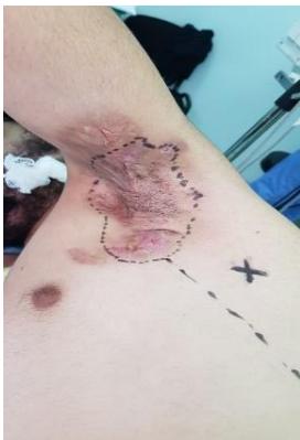
Figure 2: Pre operative markings.

A 25 years old, male smoker with no pre-existing pathological history was presented to our department with Hurley stage III. Radical excision was done followed by a 20x10cm TDAP flap to cover the defect. The patient remained in hospital under medical observation because of flap congestion, which was managed by scarifying the flap, and the patient was released 5 days later (Figures 2).