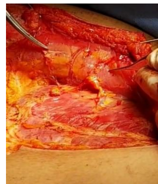
Figure 5: Septo-cutaneous perforator.

Hwang et al. described that longer flaps can be raised by using the various modifications to ensure perfusion either by including more than one perforator from the same branch of thoracodorsal vessel or perforators from different branches of thoracodorsal artery and also by including the intercostal artery perforator at the distal end of the flap (12) article thoracodorsal artery flap indeed a versatile flap [6]. The patient is placed in lateral decubitus, arm in abduction and elbow at 90 degree. The flap is raised from posterior to anterior above the muscle, care has to be taken not to injure the perforators with a very gentle dissection. In the first patient, a musculocutaneous perforator was found, and dissection was carried out until the emergence of the pedicle (Figure 4).