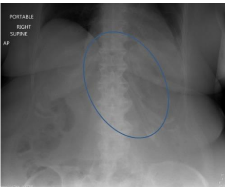
Figure 3: Anteroposterior chest radiograph showing the tip of the EWD in the stomach.