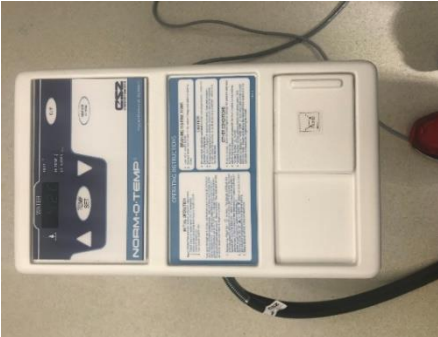
Figure 2: Norm-o-temp warming device which attaches to the EWD.