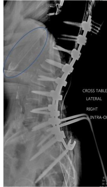
Figure 4: Lateral lumbar spine radiographs showing the tip of the EWD in the stomach.