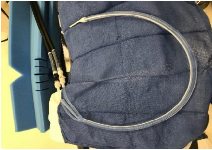
Figure 1: Esophageal warming device (EWD; clear tubing) attached to the fluid intake/return line (black tubing).