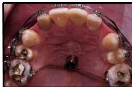
Figure 3: Transpalatal arch (TPA) connected to the onplant after a 12-week healing period. This system was utilised to reinforce anchorage in the anteroposterior plane during the retraction of the anterior labial segment.