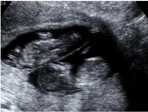
Figure 1: First Trimester ultrasound: diamniotic-dichorionic twin pregnancy.

First trimester ultrasound performed at 12+4 weeks resulted within normal (Figure 1), with both fetuses according to the gestational age, with no apparent abnormalities. The transvaginal ultrasound showed a cervical length value of 36 mm, with no funnel. Low risk combined first trimester screening (CFTS) for both fetuses, normal analytical values and negative serologies in first trimester. Prophylactic or history-indicated cervical cerclage was considered to be performed at 15 weeks, with previously vaginal and endocervical culture, and the STDs PCR test, with negative results for all of them.