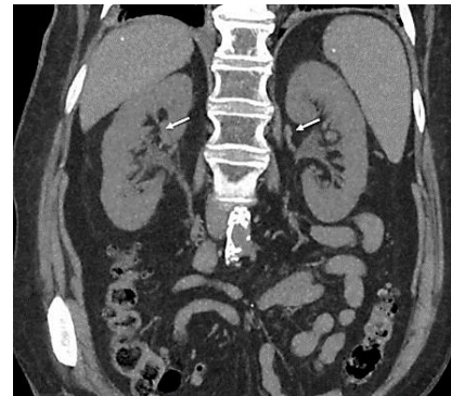
Figure 1: CT scan of the kidney, ureters and bladder showing no obstruction to be the cause of the patient acute kidney injury.

demonstrated an interstitial infiltrate of mononuclear cells including eosinophils consistent with acute tubulo-interstitial nephritis on light microscopy (Figure 2). Her Immunofluorescence was negative, and the electron microscopy showed no glomerular damage or deposition.