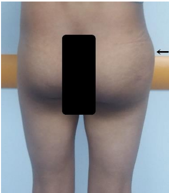
Figure 1: Clinical view showing the right hip swelling.

results. Phosphate-restricted diet was prescribed, and patient was checked regularly clinically and by imaging without detection of any recurrence after one-year follow-up.