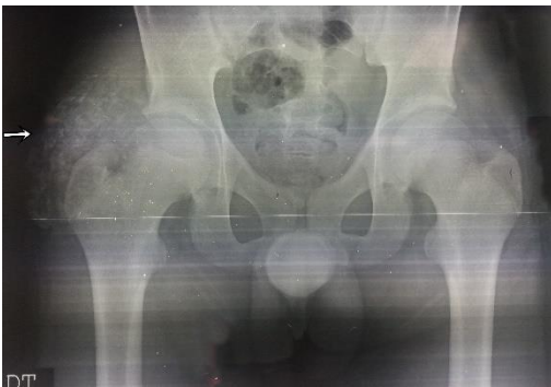
Figure 2: pelvis anteroposterior X-rays, showing a popcorn-like ossified lesion in the soft tissues of the right peritrochanteric region (arrow).