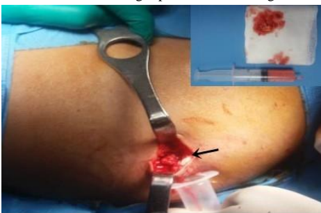
Figure 4: Operative view of the lesion that was liquid with with granulations (arrow).