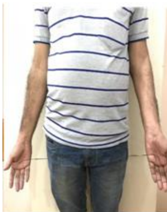
Figure 5: Postoperative photograph showing good correction of the deformity of the left elbow.