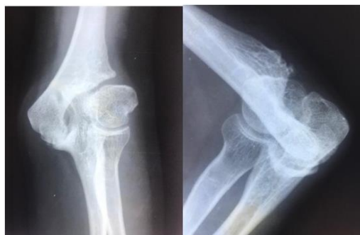
Figure 2: Preoperative radiograph (AP and Lateral views), revealing nonunion of the lateral condyle of humerus with deformity of the distal humerus.

Plain radiographs of the left elbow confirmed the presence of valgus deformity with a non-union of lateral condyle of the humerus (Figure 2). A computed Tomography (CT) scan was performed for better assessment of the anatomy and also to obtain DICOM (Digital Imaging and Communications in Medicine) images for virtual pre-operative planning and making a plastic mode (Figure 3), using 3-D printing technology. The DICOM images of the CT scan were converted into STL (stereolithography) files using the Mimics™ (Materialise, Germany) software. A virtual 3D image of the elbow joint was then reconstructed. Deformity correction was done on this virtual elbow model on a computer, by using Blender software (Dutch). Various