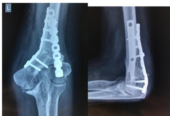
Figure 6: Postoperative follow up radiographs confirming the union of the ununited lateral humeral condyle and the osteotomy.