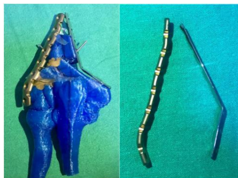
Figure 4: Preoperative planning done on a 3D printed model of the elbow. The osteotomy done to correct the deformity and contouring of the plates done to fix the osteotomy.

The surgery of open reduction and bone grafting of the non-union, corrective distal humeral osteotomy and fixation using precontoured plates was done through the posterior approach, under pneumatic tourniquet. The total tourniquet time taken was 45 minutes. No change from the preoperative surgical planning in the surgical execution of the osteotomy and fixation of the precontoured plates was required. We need not to do anterior transposition of the ulnar nerve as after the deformity correction the stretch on the nerve was relieved fully.