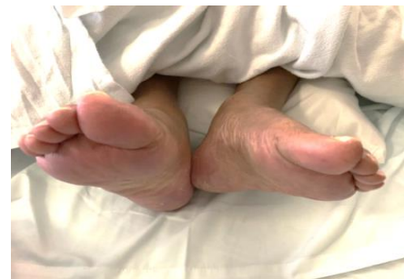
Figure 4: Appearance of a resolved phlegmasia of the left lower limb.

Thrombolysis dissolves venous thrombi and consequently minimises development of post-thrombotic syndrome. It is also advantageous in the systemic distribution of the thrombolytic agent with consequent effect on both the large and small venous channels. However, as a result of continuous drug dissemination, thrombolysis is limited in attaining optimal concentration of thrombolytic agent at the thrombus site as depicted in our patient with remnant clots despite aggressive thrombolysis. Hence, some have proposed catheter-directed thrombolysis directly into the vein with high doses of urokinase. Meanwhile, others support the use of intra-arterial low dose thrombolysis via the femoral artery, reasoning that the arterial route delivers the agent to the arterial capillaries and subsequently to the venules. The clinical advantage of catheter directed thrombolysis over systemic anticoagulation is unfortunately still questionable, as in-hospital mortality has not shown significant benefit. On the contrary, catheter-directed thrombolysis was associated with higher rates of adverse events involving higher rates of blood transfusion and intracranial haemorrhage [11]. For cases of severe PCD and/or venous gangrene, venous thrombectomy is usually performed. It allows instant