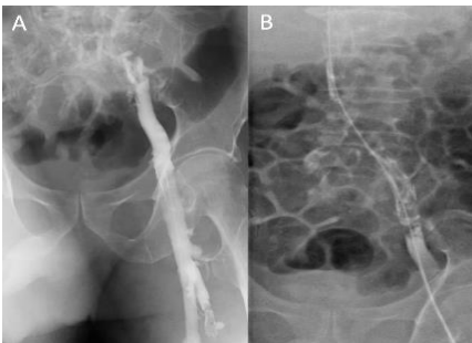
Figure 2: Venogram showing (A) patent left common iliac vein post-thrombolysis and (B) retained clots in the IVC filter.