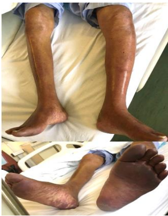
Figure 1: Phlegmasia cerulea dolens with swelling and purpura of the left lower limb.

To prevent irreversible venous gangrene and subsequent limb loss, the patient underwent an urgent left lower limb percutaneous venous thrombectomy (AngioJet, Possis Medical, Minneapolis, USA) with catheter-directed thrombolysis using urokinase due to the presence of remnant clots at the IVC filter (Figure 2). Patient was also maintained on continuous infusion of unfractionated heparin at targeted therapeutic levels of activated partial thromboplastin time (APTT) between 55 to 75 seconds. Blood clots persisted at the IVC filter despite thrombolysis and these were rectified via deployment of two venous self-expanding stents, the Zilver Vena venous stent (Cook Medical, Bloomington, Indiana, USA), to alleviate the persistent occlusion with good venous flow post-stenting (Figure 3). Patient was maintained on heparin and two days post-operatively, oedema and the purpuric appearance of the lower extremity subsided completely (Figure 4). Patient recovered uneventfully and was discharged well post-operative day 5.