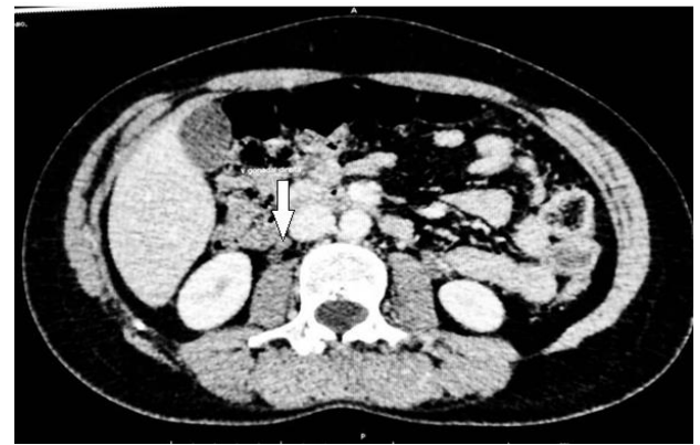
Figure 1: Complete occlusion of the right ovarian vein distal to the thrombus – CT cross section.