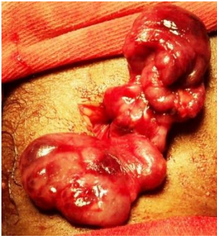
Figure 1: Operative picture of the lobulated sub-mandibular gland tumor.

On gross pathology the gland was lobulated with thin capsule. The cut surface showed multiple cystic spaces separated by multiple septa and contained dark brown coloured fluid. (Figure 2). On microscopy the tumor had distinct two component, the epithelial and lymphoid component, which are diagnostic of Warthin's tumour. The epithelial component consisted of multiple cystic spaces lined by double layered epithelial lining. The lymphoid component had large collection of lymphoid tissue adjacent to the epithelial tissue. (Figure 3).