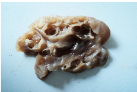
Figure 2: Gross picture of the tumour showing cystic spaces.

On gross pathology the gland was lobulated with thin capsule. The cut surface showed multiple cystic spaces separated by multiple septa and contained dark brown coloured fluid. (Figure 2). On microscopy the tumor had distinct two component, the epithelial and lymphoid component, which are diagnostic of Warthin's tumour. The epithelial component consisted of multiple cystic spaces lined by double layered epithelial lining. The lymphoid component had large collection of lymphoid tissue adjacent to the epithelial tissue. (Figure 3).