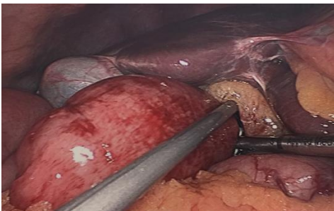
Figure 2: Laparoscopic finding of herniated small bowel loop through foramen of Winslow.