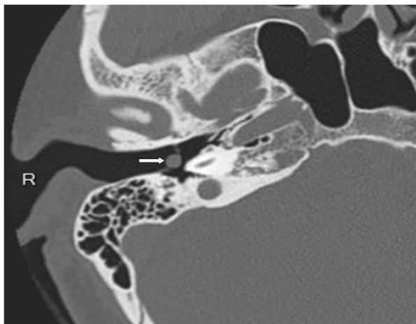
Figure 1B: Computed tomography (axial view) with thin cuts of the temporal bone revealed a 3 x 4 mm soft tissue mass (arrow) over central part of right ear drum.