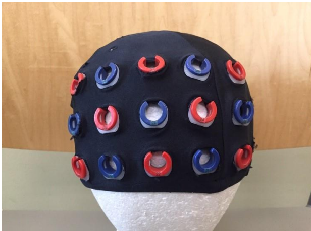
Figure 1: Optode set up

In addition to identifying an item that functioned as a reinforcer, we introduced a token economy system [22, 23]. According to the mother, the child was familiar with token economy systems from prior EIBI. The token economy consisted of a simple sheet of paper with five boxes that was placed in front of the child. A box was checked by the experimenter after a time period had elapsed. Time periods changed depending on the progression towards tolerating the fNIRS cap. The time period was determined prior to the beginning of each desensitization session. Initially, each time period was 120 seconds long for wearing the cap without any optodes. With increased optodes in the cap the length initially decreased to 60 seconds intervals before returning to 120 second intervals. A timer was placed in front of the child to provide feedback for the child and to track the time accurately. When all ten boxes were checked, the fNIRS cap was taken off the child and the reinforcer was delivered.