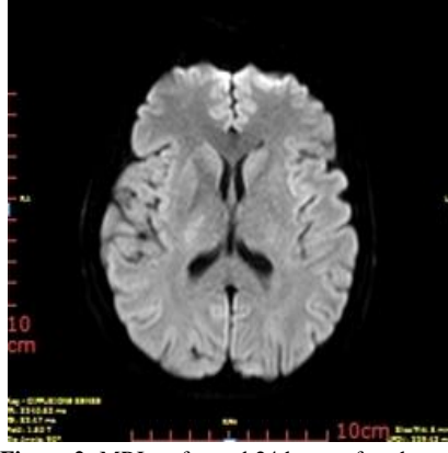
Figure 2: MRI performed 24 hours after the acute event: small area of altered signal at the posterior arm of the right internal capsule.

Figure 1: MRI performed at a distance of three hours of symptom onset showed a restriction area of proton diffusivity in diffusion-weighted imaging (DWI), having lenticular morphology of about 15 mm, with consensual reduction of the values of the apparent diffusion coefficient. The angiographic sequences showed no significant alterations in caliber and course of the main vessels of Willis.