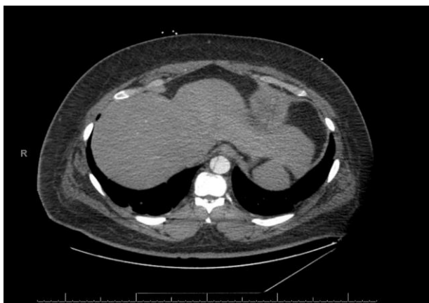
Figure 2: CTA showing the dissection flap extending to the abdominal aorta