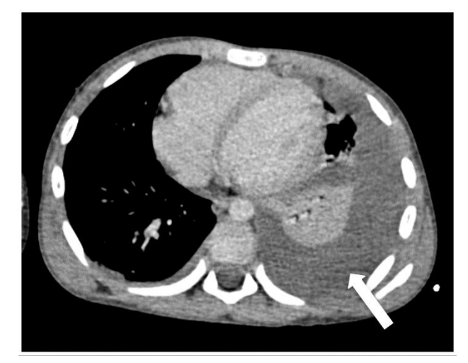
Figure 1: A) Abdominal CT imaging demonstrating subscapular hypodensities measuring 7.2 x 3.9 cm in the lower pole of the spleen (arrow). B) Chest CT scan showing moderately large pleural effusion (arrow).

hematoma or abscess. On hospital day one, he underwent ultrasoundguided aspiration of his splenic fluid collections with subsequent drain placement. The resulting purulent fluid was sent for analysis with gram stain, aerobic, anaerobic and fungal cultures. The fluid culture yielded gram-positive rods that were later identified as S. intermedius , and all other surgical cultures were negative. The remainder of his infectious work up including serologies for Epstein-Barr virus, cytomegalovirus, Echinococcus, Bartonella and Brucella titers, blood-based tuberculosis testing with interferon-gamma release assay, and blood and urine cultures all resulted negative.