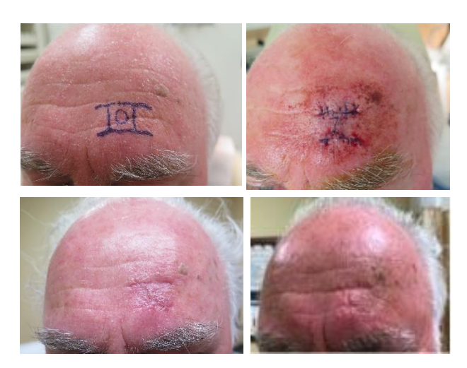
Figure 2: Representative case: nodular BCC on the left forehead excised and repaired with a bilateral advancement flap (Patient DD).

(A) Preoperative marked clinical photograph. (B) Immediate postoperative clinical photograph. (C) Postoperative clinical photograph at 17-month follow-up. (D) Postoperative clinical photograph at 24-month follow-up.